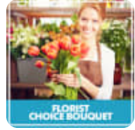
FLORIST CHOICE BOUQUET